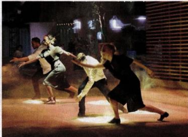
Music, dance, DJs, street artists and a stamp workshop, below, are all part of the experience at Warehouse421. Vidhyaa for the National