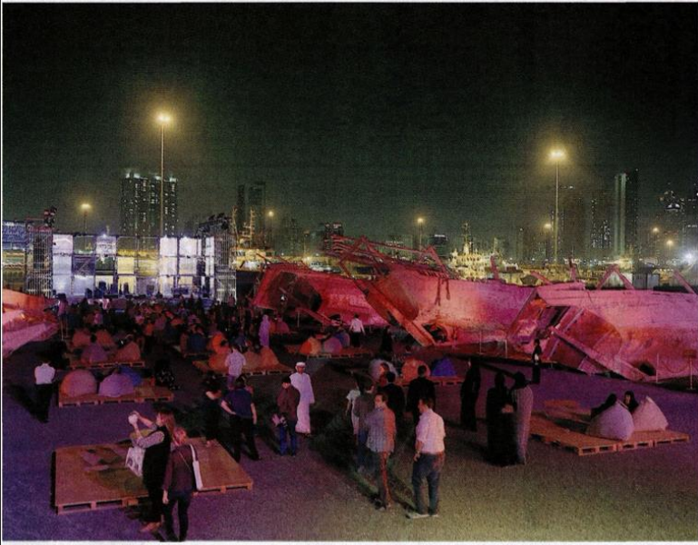
Warehouse421 in the port area of the capital nestles comfortably against the city backdrop.